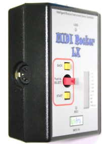
MIDI OUT Option

In addition, the LX automatically filters out the extra data which can cause "double-hit" issues with some drums (especially Roland drums on the Wii).