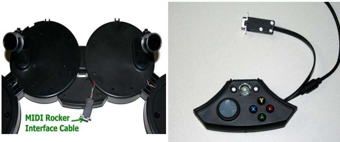
Option A: Rock Band Drums with MIDI Rocker Interface Cable

One end of the interface cable has to be soldered to pads on the Rock Band drum controller board. The other end of the cable is plugged into the 15-pin connector on the side of the MIDI Rocker LX. You can leave the original drums intact and just plug the interface cable into the MIDI Rocker when you want to use the the MIDI Rocker LX (see below, right), or you can cut the drum controller module from the rest of the drums (see below, left).